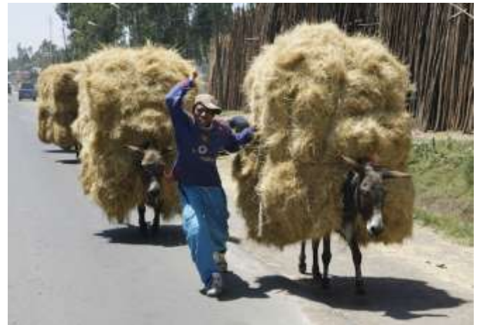
Donkeys transporting straw in Ethiopia

About three years ago, I had the opportunity to tour one of the Brooke clinics, in Aswan, Egypt, and was extremely impressed by the work this charity performs, the incredible need they address and the dedication of these veterinary professionals.