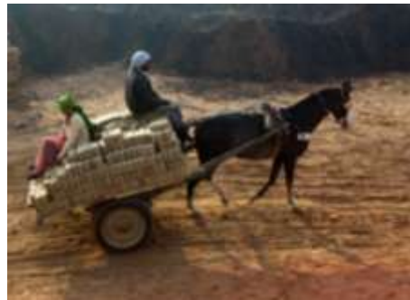
Noor and Nasheema with their horse Basanti at the BK Tayal brick kiln in Uttar Pradesh, northern India.

There are around 100 million working horses, donkeys and mules across the world and during the course of their lives, it is estimated that more than half of these animals suffer from exhaustion, dehydration and malnutrition as a result of excessive workloads and limited animal health services.